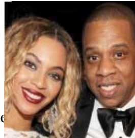
2 Beyonce and Jay Z Kiss Divorce Rumors Goodbye