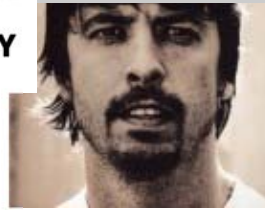
10 Cover Songs Better Than the Original