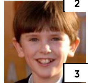
3 Popular Child Stars Who've Grown Into a Completely New Look

In a moment of levity, Swift seemed as though she was about to leap off the huge 1989 sign on the stage. Instead, she stopped the song in its tracks, peeked at the plunge and told the audience, "I'm not jumping off of there. People getting bit by snakes, it's ridiculous." It was a sly a nod to the snake-bite mishap that went down during Nicki Minaj's VMA rehearsals over the weekend, and it definitely got a few laughs. Encouraged, Swift then took "Shake It Off" home.