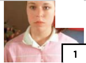
1 What the 'Napoleon Dynamite' Cast Looks Like 10 Years Later